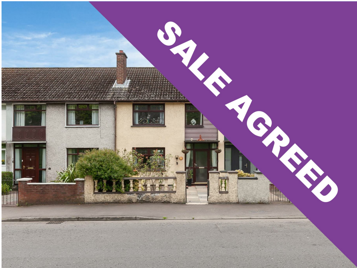
52 Old Irish Highway, Newtownabbey, BT37 9LQ